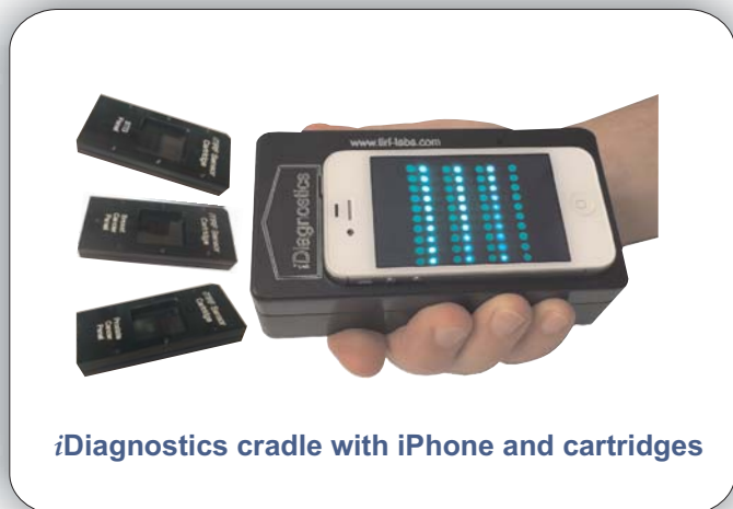
iDiagnostics cradle with iPhone and cartridges

Cell Phone Based Molecular Diagnostics - iDiagnostics (iTIRF)